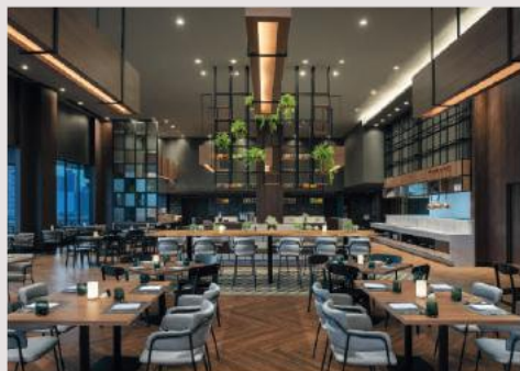
Greenhouse Restaurant 7F

Dine all day on honest, tasty cuisine in cool surroundings. Grab dinner al fresco or laze by the pool sampling guilty pleasures and dynamite drinks. Food is what you choose here in the city.