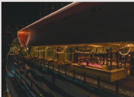
Greenhouse Terrace Bar 7F

Rise above the bustling city and mellow out high above Bangkok's iconic skyline in our open-air terrace bar