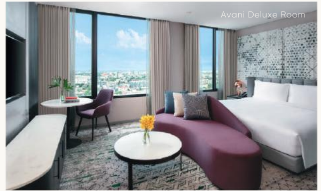
Avani Deluxe Room