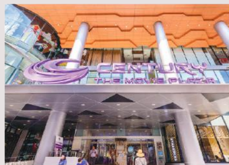
Century B1F - 4F The Movie Plaza 2 / Shopping Mall

Open daily, 6:00 a.m. - 10:00 p.m. or 24 hours with key card