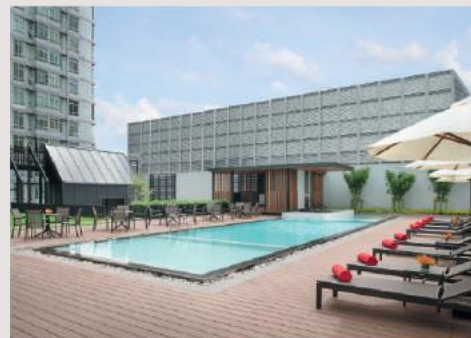
The Deck - Pool & Bar 9F

Customised cocktails and hit-the-spot snacks