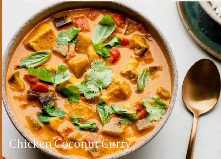
Chicken Coconut Curry

Served with Soy Bean Paste and Sesame Sauce