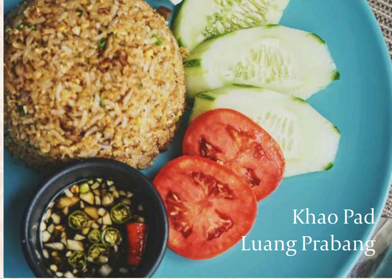
Khao Pad Luang Prabang

Egg Fried Rice, Prepared with Spicy Luang Prabang Sausage and Salted Egg