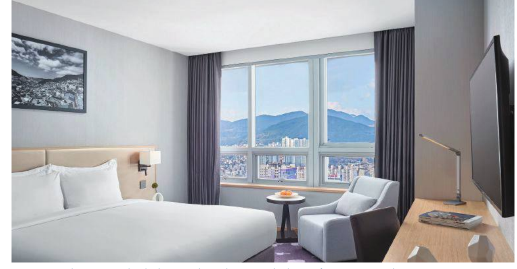
Avani Central Busan Hotel, which opened in February in the heart of Busan, Korea, has 289 contemporary guestrooms and suites, offering mountain or city views.

Belgium-based hospitality company Zannier Hotels is set to make a splash in Vietnam this summer with the opening of Bãi San Hô, a new beachfront resort. Nestled on a 240-acre estate of lush gardens and pristine beachfront in Phu Yen province, a coastal enclave known for its stunning beaches and landscapes in the south of the country, Bãi San Hô will have 71 villas divided into three architectural types: Hill Pool Villas, designed in the style of the Ede tribes; Beach Pool Villas, inspired by the Cham tribes; and Cluster Villas, built on traditional stilts next to rice paddies. Note that 46 of the villas will come with their own private pools.