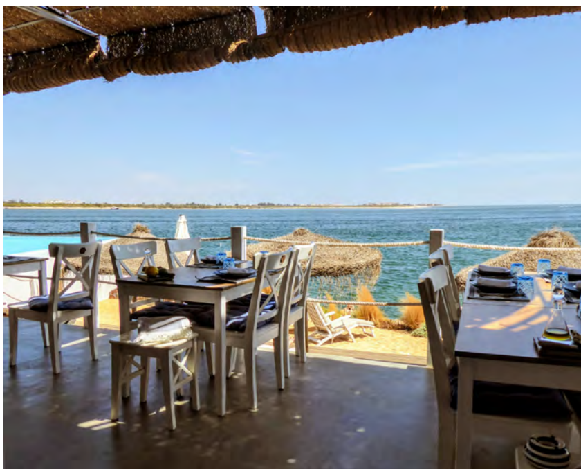
The Grand Beach Club, at Grand House Algarve.

That said, I think that this hotel is much