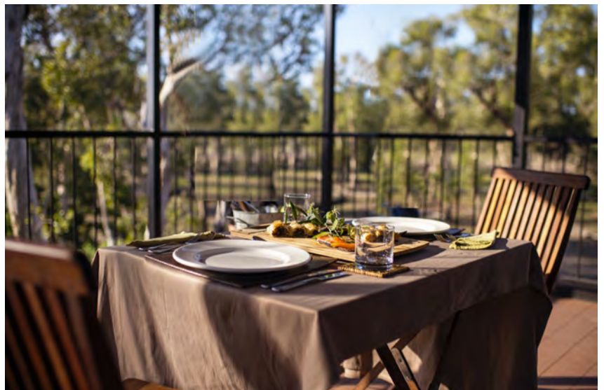
A private lunch, at Bamurru Plains.

As with most safari lodges, dining is communal, but remarkably sophisticated, given the remoteness of the property. The day begins early with what is referred to as 'a light breakfast', but in fact includes rather more than I would normally eat, such as 'bush eggs' in any style and accompanied