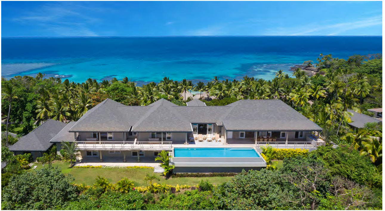
Looking down upon a 3-bedroom Sunset Villa, at Kokomo Private Island.

ing materials and ensuring a low environmental impact. Thus, fallen or old cinnamon trees were employed in the build, and local stone from the surrounding islands.