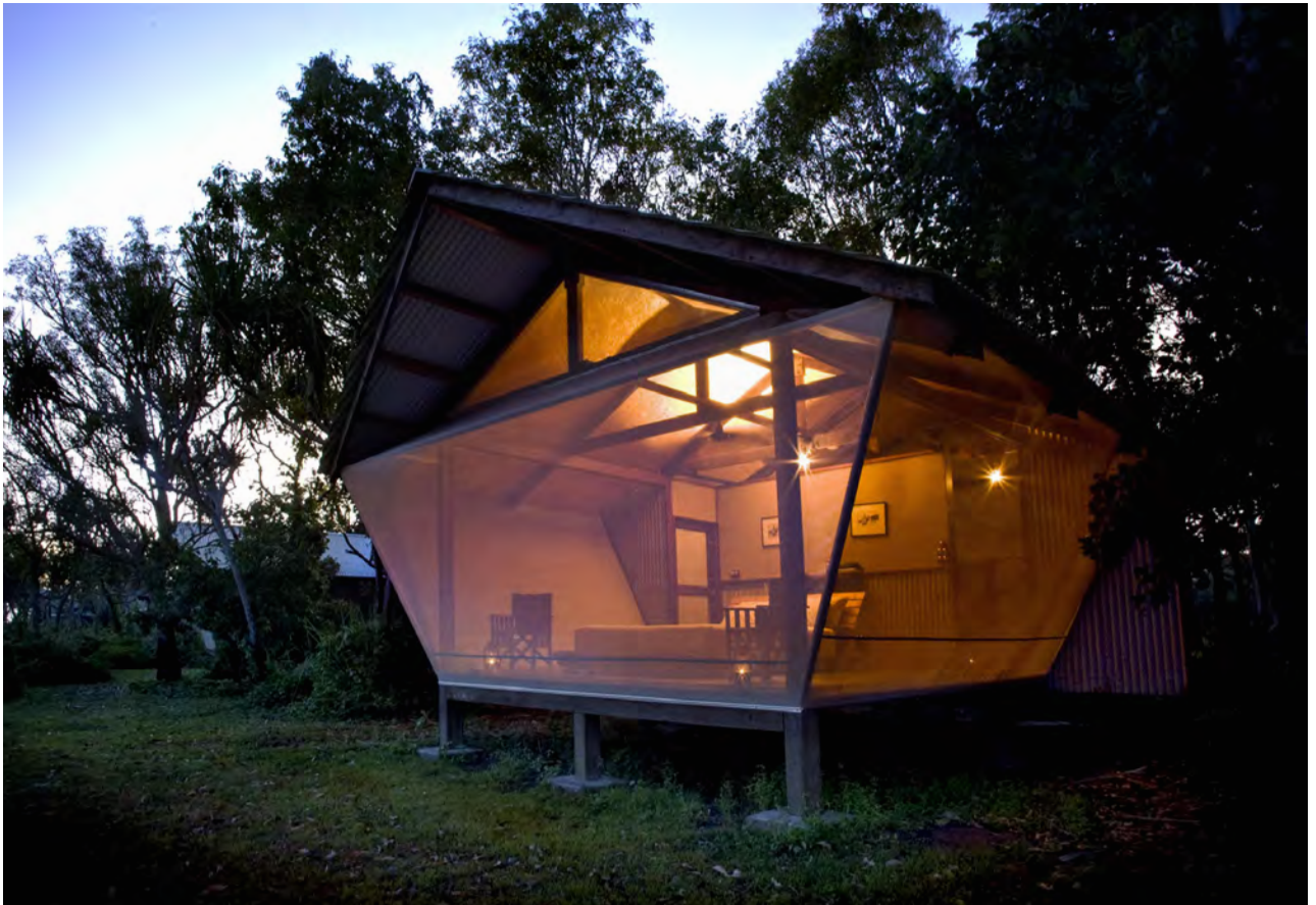
A simple entry-level Safari Bungalow, at Bamurru Plains, Australia.

There is much for the senses to appreciate; the sound of white Corella cockatoos and Magpie Geese and the sudden blue flash of a Kookaburra. The Mary River is home to around 236 species of birds; many of which spend their time at Bamurru, such as the extraordinary Jacanas birds that seem