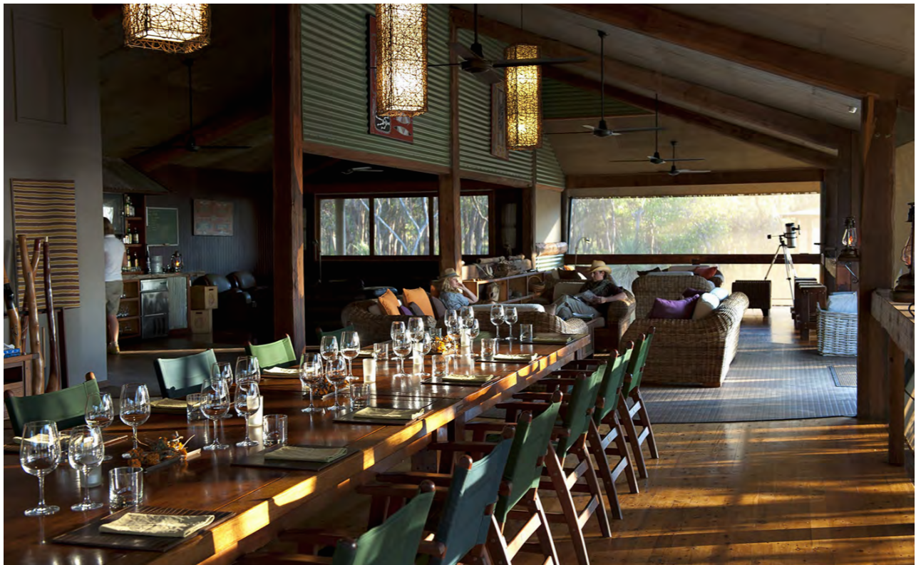
In true safari fashion, communal dining, at Bamurru Plains.

The bathrooms are very well thought through, wrapped around one side of the bungalow, rather like those at Amanwana, replete with high-pressure showers and plenty of hot water. However, there are no