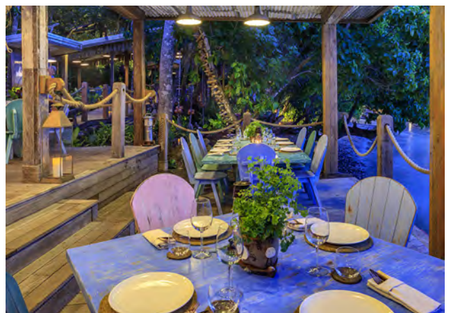
At Kokomo Private Island, dinner at the Beach Shack, left, and, right, at Walker D'Plank.