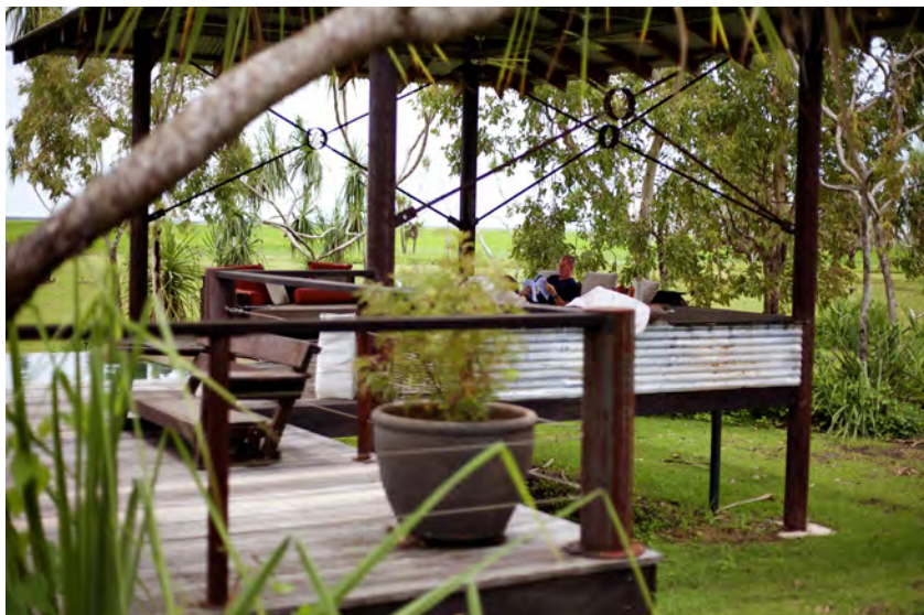
Relaxing on the deck of the Lodge, at Bamurru Plains, Australia.

Beach lovers will not be wildly impressed,