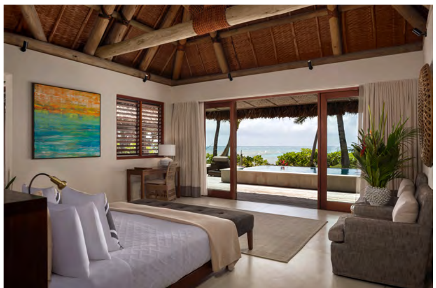
Comfortable 1-bedroom Sunrise Villa, at Kokomo Private Island.

Two beaches front the island's 21 Sunrise and Sunset Villas, which range from 1-3 bedrooms; each Villa with its own infinity edge pool and private deck, opening on-