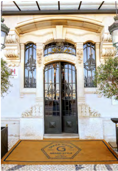
Entrance to Grand House Algarve.

but then, this is more of a venue to lounge beneath a thatched palapa and catch the sun and sea breezes. A small infinity edge pool overlooks the water, together with a sandy sun deck by the public beach, which is so tiny that it disappears entirely when the tide comes in. Foodies, however, will relish this quirky little hideaway; its understated restaurant serving excellent local fare, such as a light Algarve Cataplana and giant