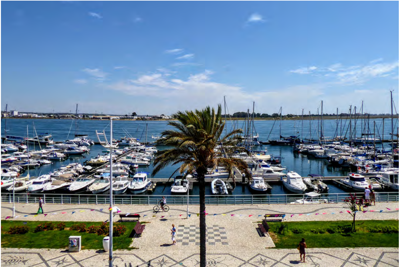
View from Grand House Algarve of the marina.

The rooms and suites are beautifully decorated in blends of soft white and neutral tones, parquet floors, antique chests and crystal chandeliers. Artworks, with references to the past, abound, from ancient prints to black and white lithographs.