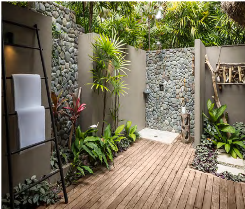
At Kokomo Private Island, the outdoor bathroom area of a 1-bedroom Sunrise Villa.

to virtually private stretches of white sand beach and crystal waters.