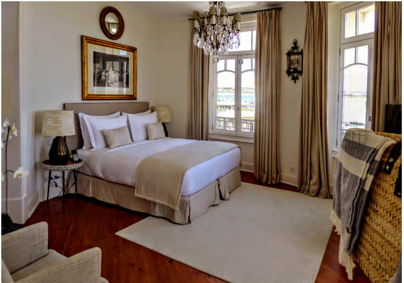
Bedroom area of Grand House Suite, #201, at Grand House Algarve; the marina views beyond.

Most of the bathrooms are shower-only, stylishly tiled in black and white and with custom-made towels from the Portuguese city of Guimarães.