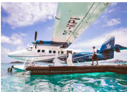
Arriving at Kokomo Private Island.