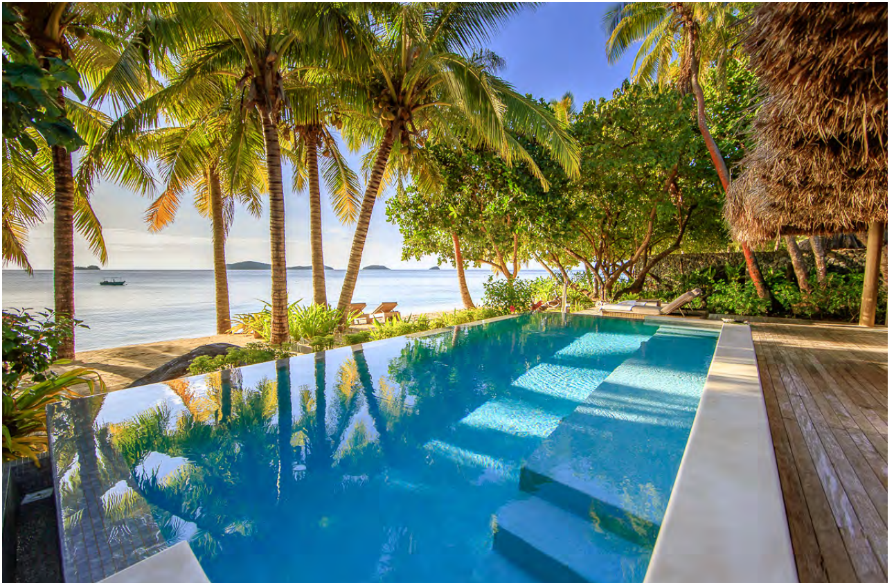
At Kokomo Private Island, the private pool of a 1-bedroom Sunset Villa looks onto the beach beyond.