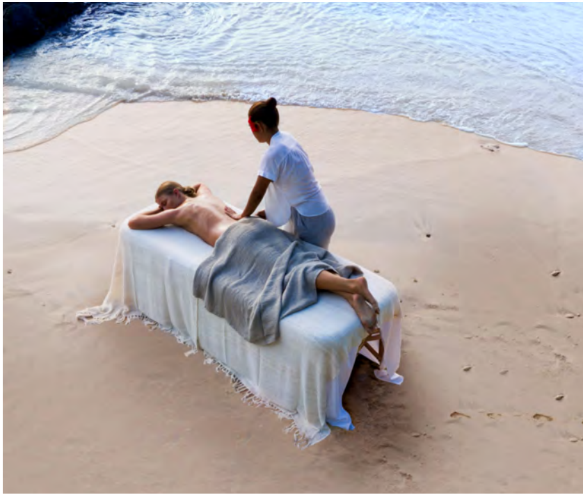
Massage on the beach, at Kokomo Private Island.