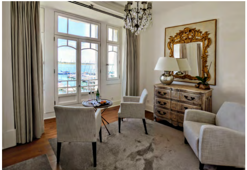
Sitting room overlooking the marina, at Grand House Algarve.

but then, this is more of a venue to lounge beneath a thatched palapa and catch the sun and sea breezes. A small infinity edge pool overlooks the water, together with a sandy sun deck by the public beach, which is so tiny that it disappears entirely when the tide comes in. Foodies, however, will relish this quirky little hideaway; its understated restaurant serving excellent local fare, such as a light Algarve Cataplana and giant