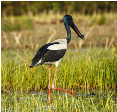
Wildlife on your doorstep, at Bamurru Plains.

Most of the property runs on solar power