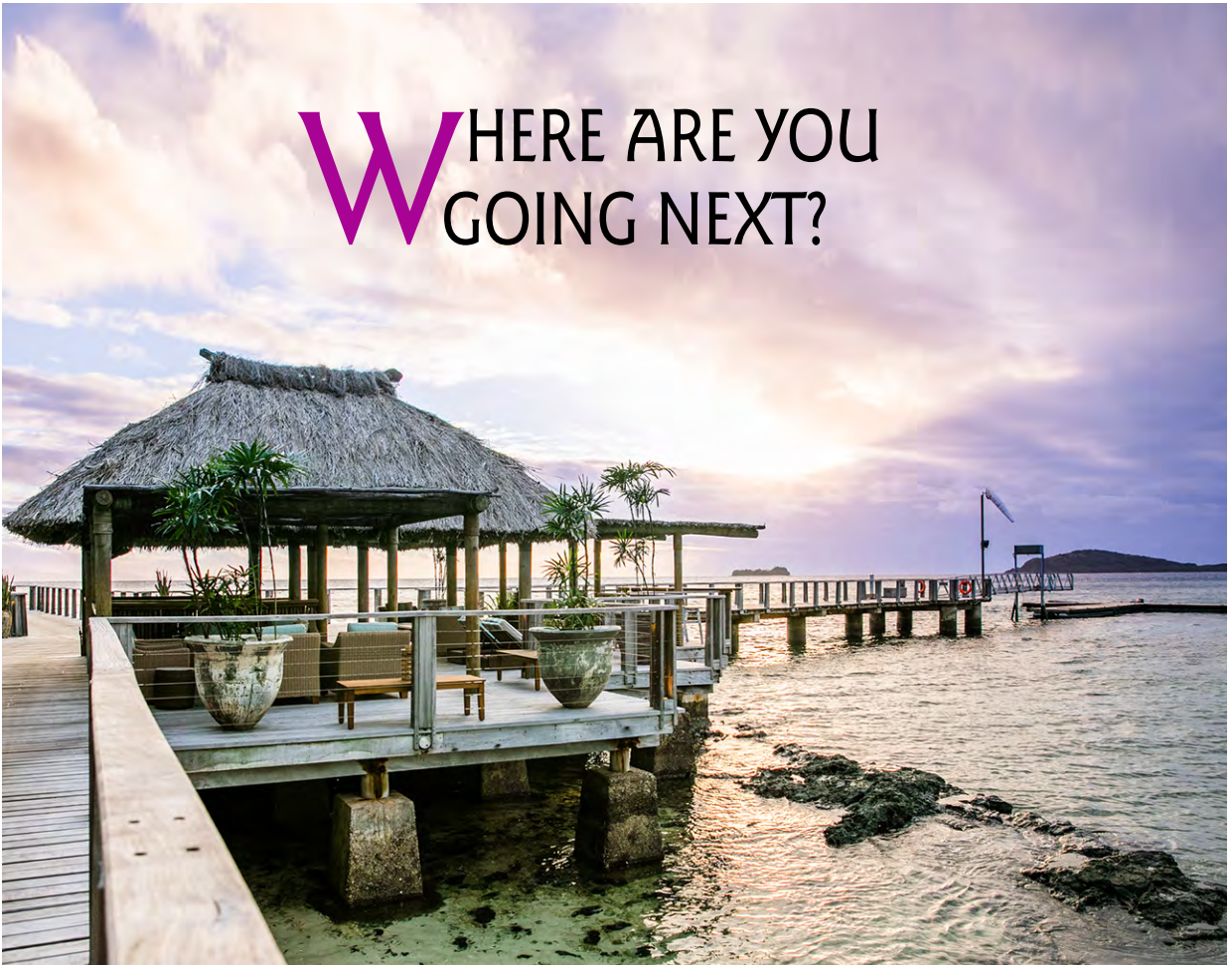
The arrival jetty, at Kokomo Private Island, Fiji.

Hope springs eternal, as some parts of the world reopen and more of you begin to travel again. Some Members, however, never stopped and I found myself journeying virtually via your emails, from Europe to South America