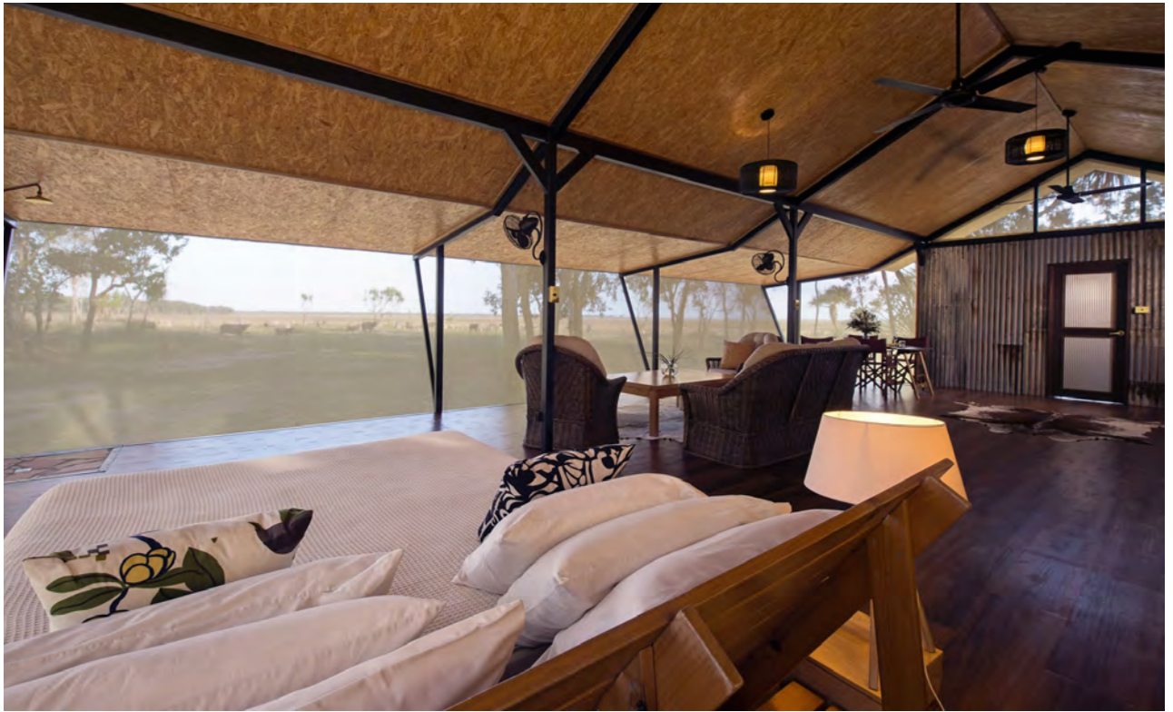
The Kingfisher Suite, at Bamurru Plains, where you awake to the wildlife rather than to your Smartphone.

to walk on water. Then there are the Wallabies, which I never tire of watching, and a raft of reptiles that happily keep their distance.