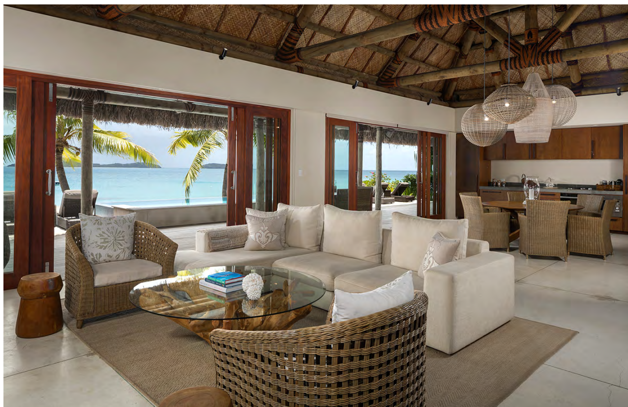
The living area of a 3 bedroom Sunset Villa, at Kokomo Private Island.

The look here merges traditional Fijian design with a quiet contemporary style; the interiors by Sydney-based designer, Philip Garner, who was determined to keep them light and simple, so as to frame the ocean and rainforest vistas. Architect, Keith Lambert, was equally respectful of the island's natural beauty, sourcing sustainable build-