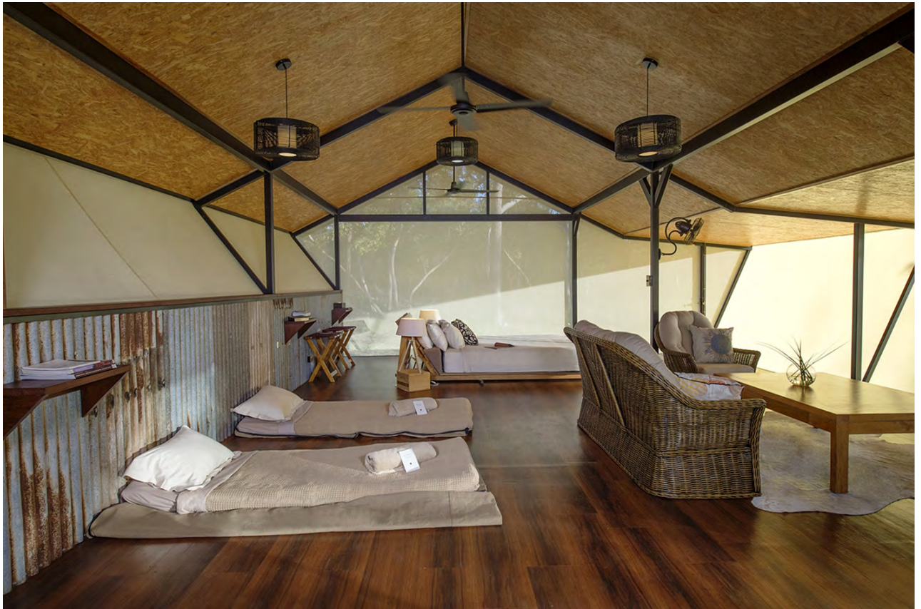
At Bamurru Plains, children (over 6) sleep in 'Swag Bags', whilst parents get the full bedonistic treatment, with super-comfortable beds and linens.

by bacon and various relishes, freshly baked muffins, muesli, yoghurt and so on. This sets you up for an early morning excursion with one of the Guides; an airboat safari across the floodplains, perhaps, or bird-watching from The Hide, a river cruise, game drive or guided walk. You choose. Then it's lunch at the Hide, or on the wild-life observation deck; with salads and such to keep you going until canapé and sun-downer time, which is followed by a 3-