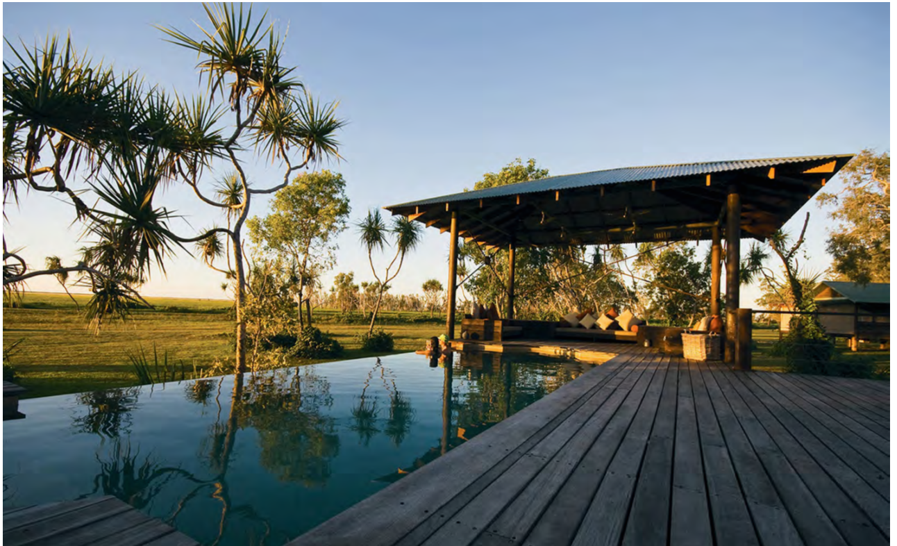
The main infinity-edge pool at Bamurru Plains, where rusticity has a decidedly upscale feel.

TVs, CD players, mini-bars, telephones, internet access or even a laundry service, so pack light, but make sure you have enough clothes for your stay.