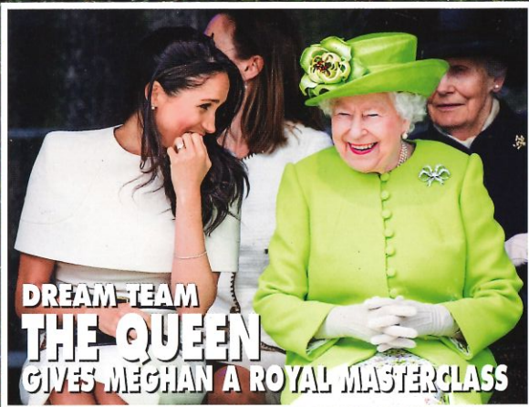
DREAM TEAM THE QUEEN GIVES MECHAN A ROYAL MASTERCLASS