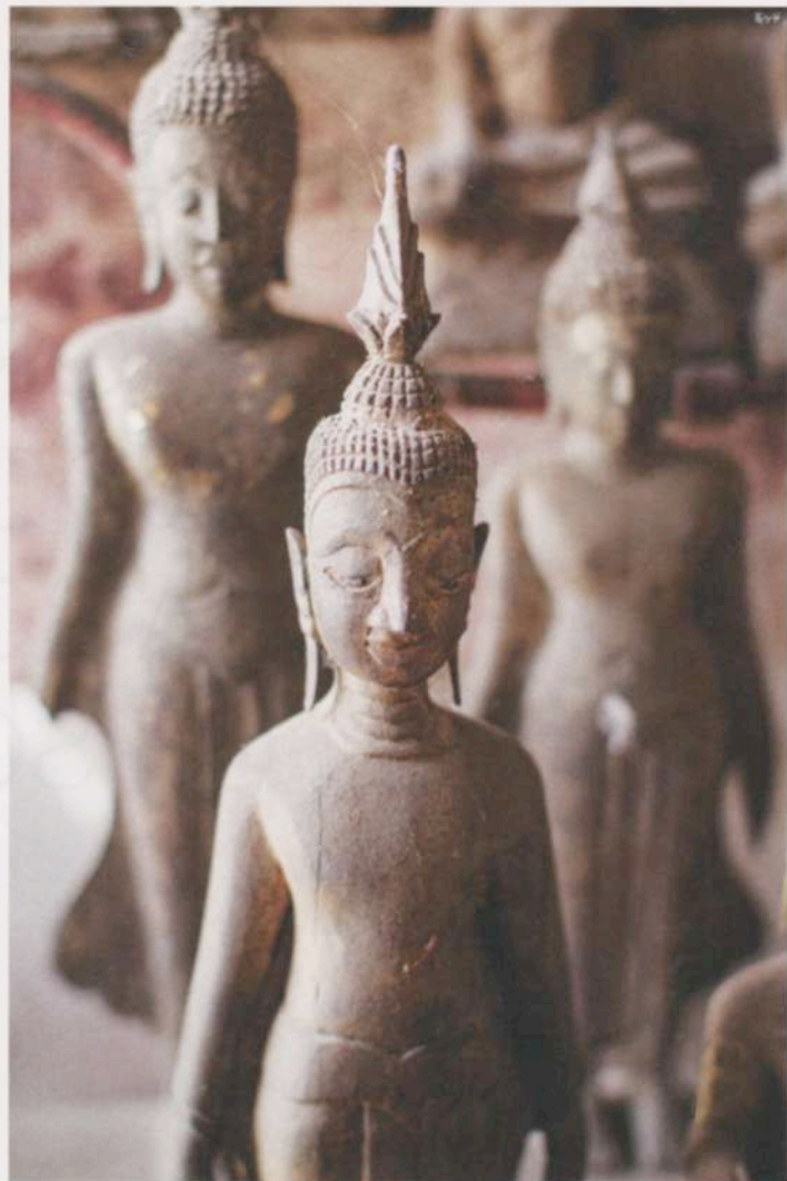
ILLUSTRATION BY SHARON SHAW.

28-room property exudes serenity and lost grandeur. As if on cue, a buttercream-colored Rolls-Royce glides past on the street beyond, with an elegant, white-haired Laotian woman seated in back. Who is she? Where is she going? There are mysteries in Luang Prabang. And, I come to learn, ghosts.