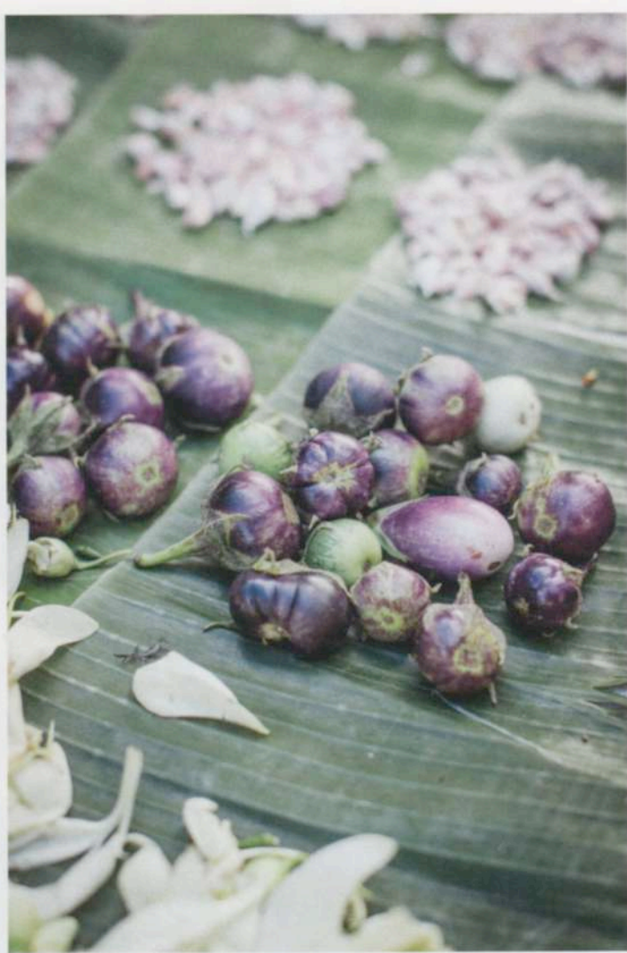
Market bounty (from far left): cooked river crabs bundled together by bamboo ties; frogs, which thrive in Laotian rice fields, and fish, displayed on mats of banana leaves; rounds of dried Bengal quince, a tropical fruit that locals steep for a medicinal tea; eggplants sold in batches for a dollar.

at the Night Market. I snake through their stands to the Mekong. By the time the cotton and silk scarves, embroidered textiles, silver bangles, and Beerlao T-shirts are unpacked and enticingly displayed, the sky has turned from lemon to a deepening indigo, and I am waiting for Van by the river.