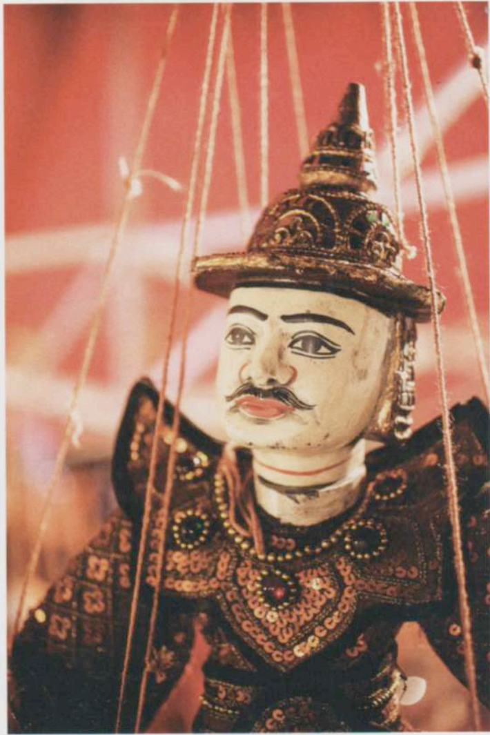
In vivid detail (from far left): water lilies blooming in the former Royal Palace ponds; some of the thousands of Buddha statues in the sacred Pak Ou Caves; painted roof batters in Wat Xieng Thong, Luang Prabang's most important temple; a marionette for sale at the Night Market.

from a gilded temple where monks clad in marigold orange robes whitewash the walls. An iron pot full of a tangle of rice noodles bubbles away, heated by a wood fire. The owner welcomes us with big broth-filled bowls and piles of fresh mint, basil, and lettuce leaves in a dozen shades of green. We spoon in jeow bong sauce—orange and scarlet and sweet and sour. Additional plates of sticky rice, bean sprouts, limes, and long beans, as well as small bowls of fish sauce and fermented shrimp paste, crowd the table. The bounty finds its way into our bowls. All is simple, yet with a complexity of flavor.