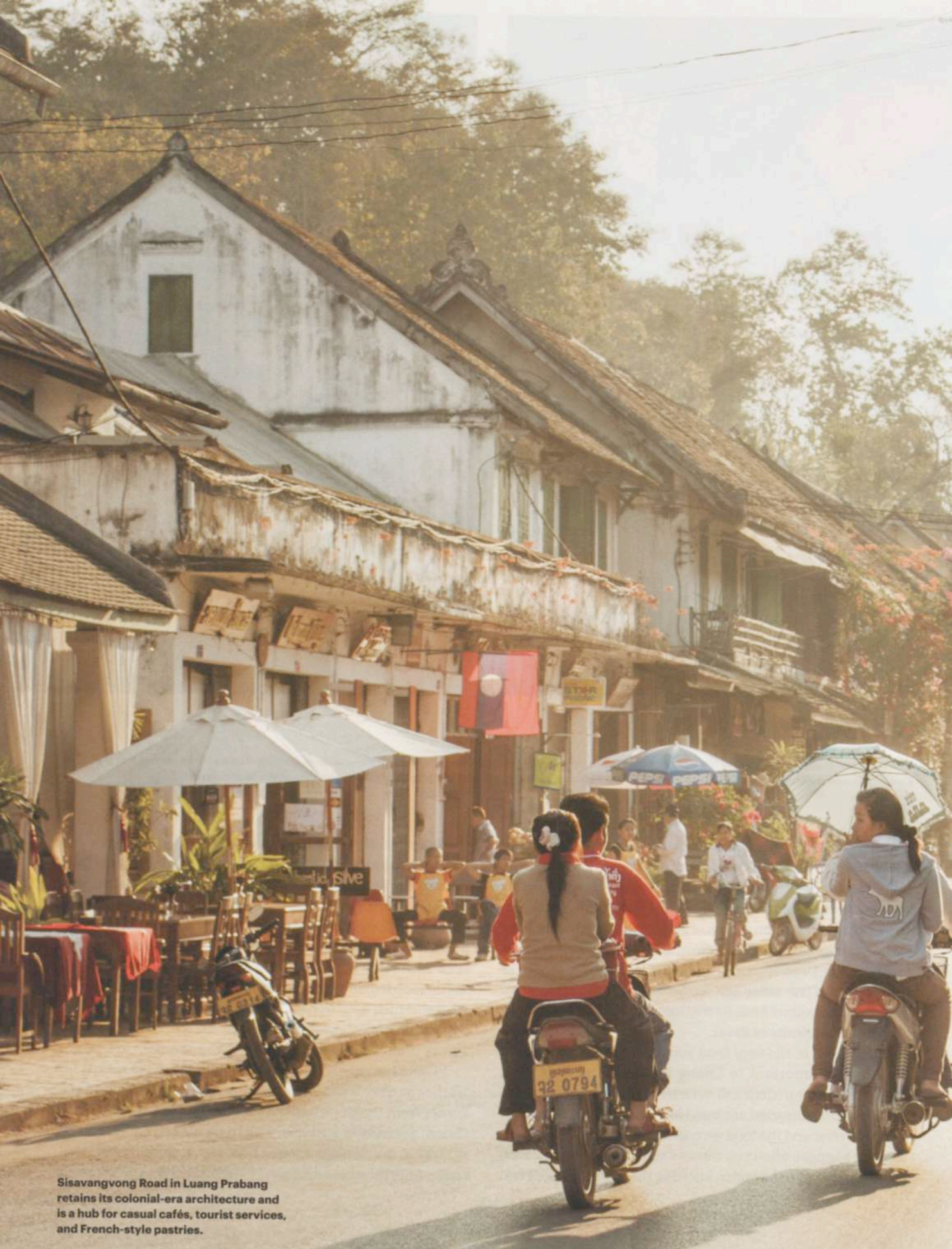
Sisavangvong Road in Luang Prabang retains its colonial-era architecture and is a hub for casual cafés, tourist services, and French-style pastries.