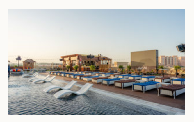
Pele's Pool Bar

24 hours a day All your favourites and some of our specialities.