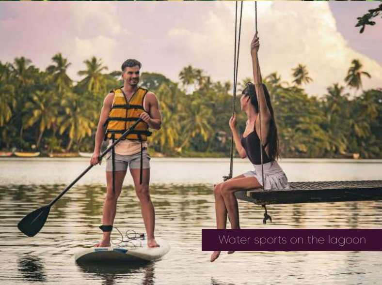
Water sports on the lagoon