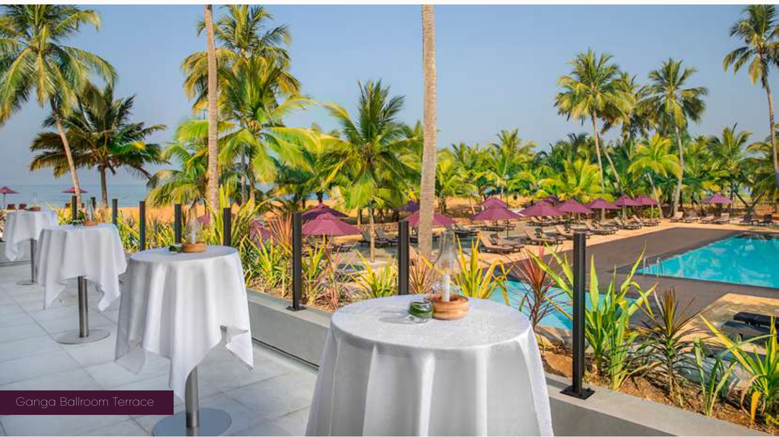
Ganga Ballroom Terrace