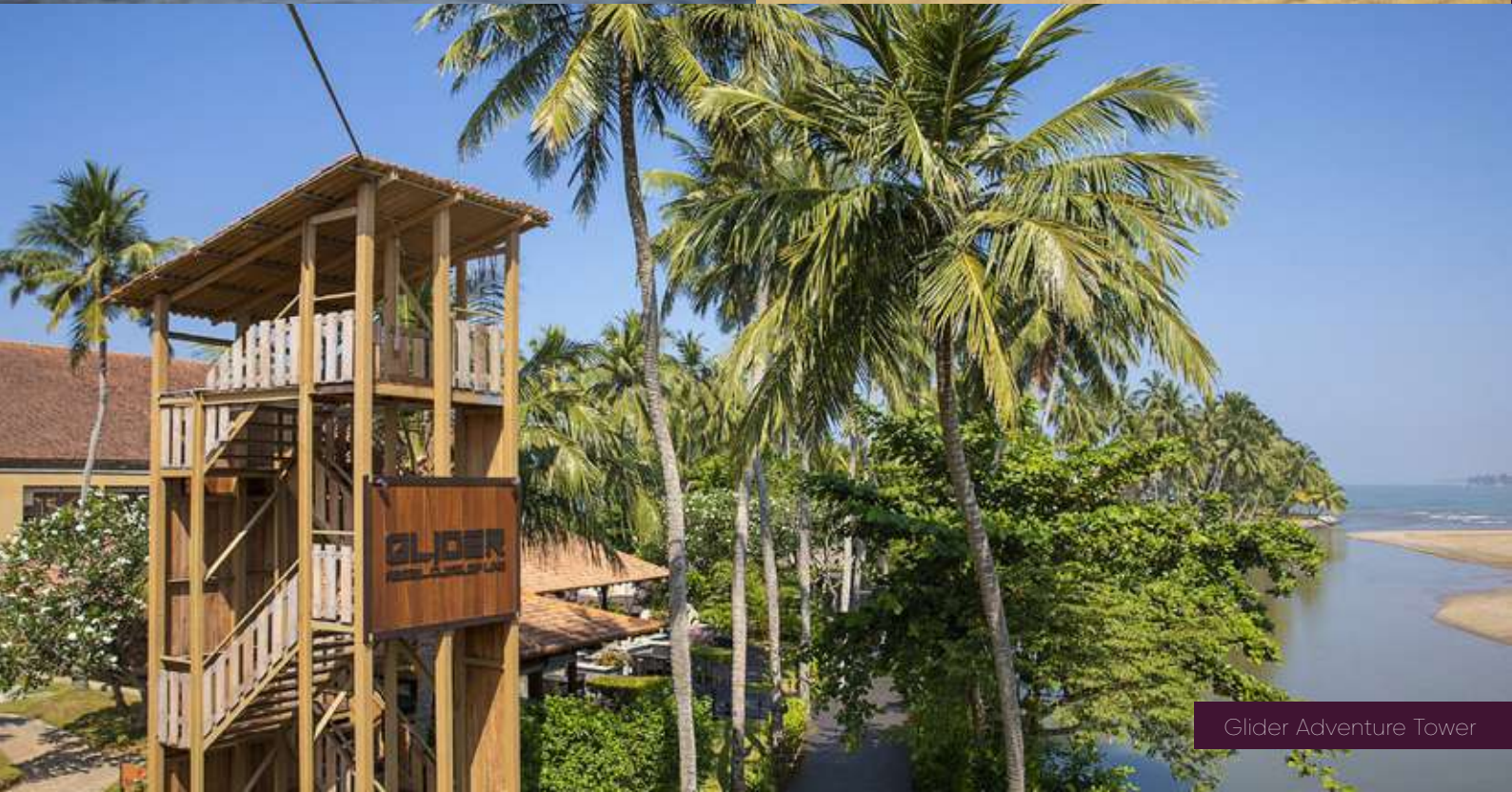
Glider Adventure Tower