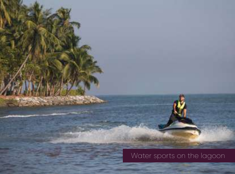
Water sports on the lagoon