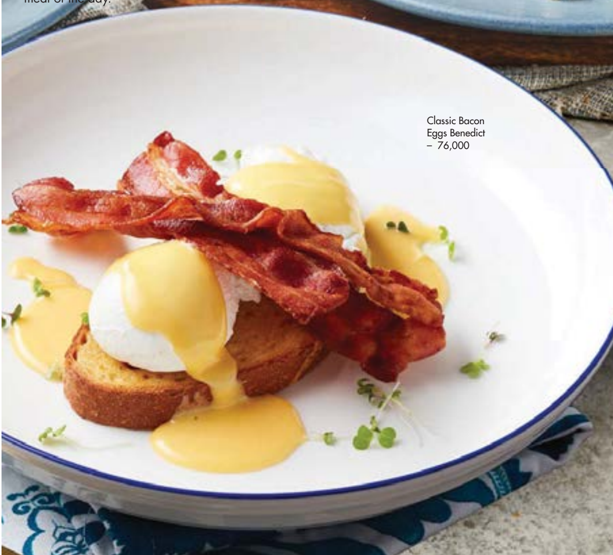
Classic Bacon Eggs Benedict - 76,000

THE COFFEE CLUB is long known for breakfast and brunch offerings that we take pride serving all day long. Visit any of our stores located all over the world, you'll find tasty, hearty breakfast and brunch dishes delicately made using well-selected, imported ingredients. We make sure you get sufficient nutrients for every important meal of the day.