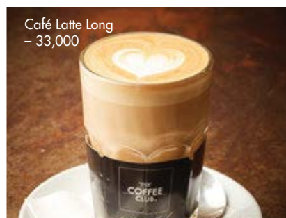
Café Latte Long - 33,000