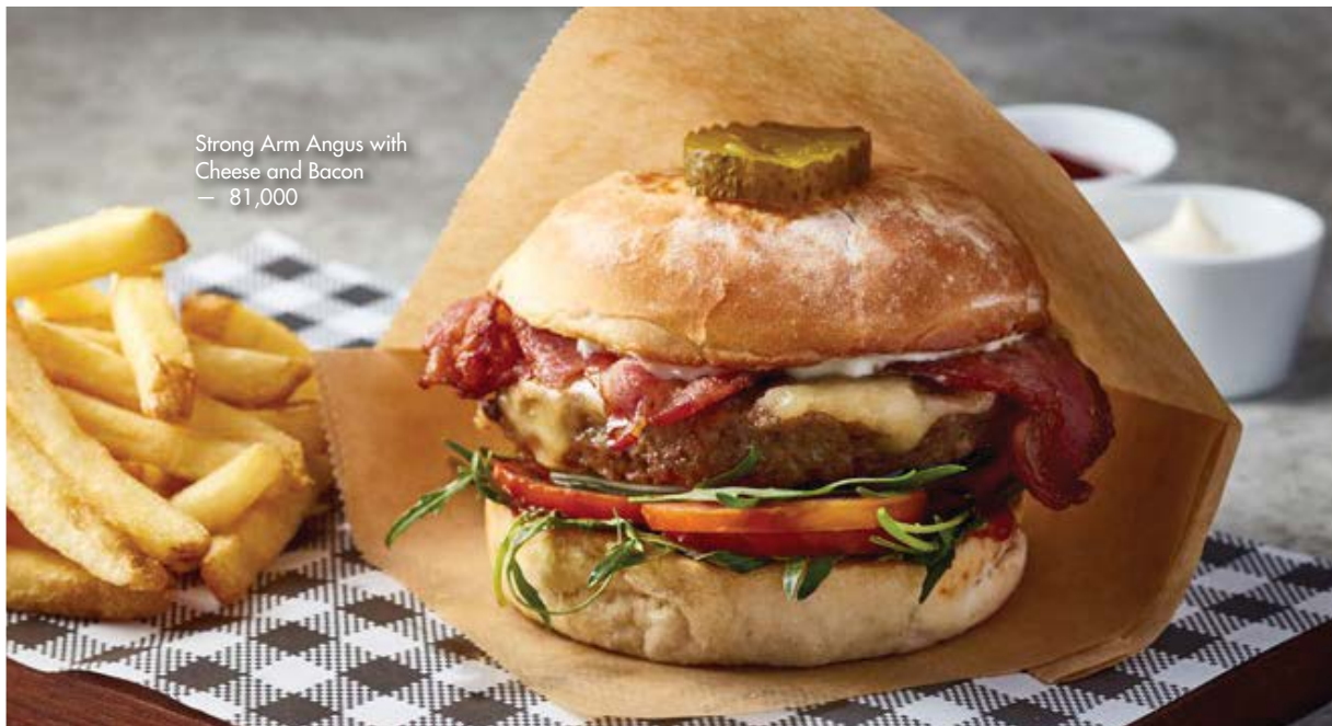
Strong Arm Angus with Cheese and Bacon - 81,000