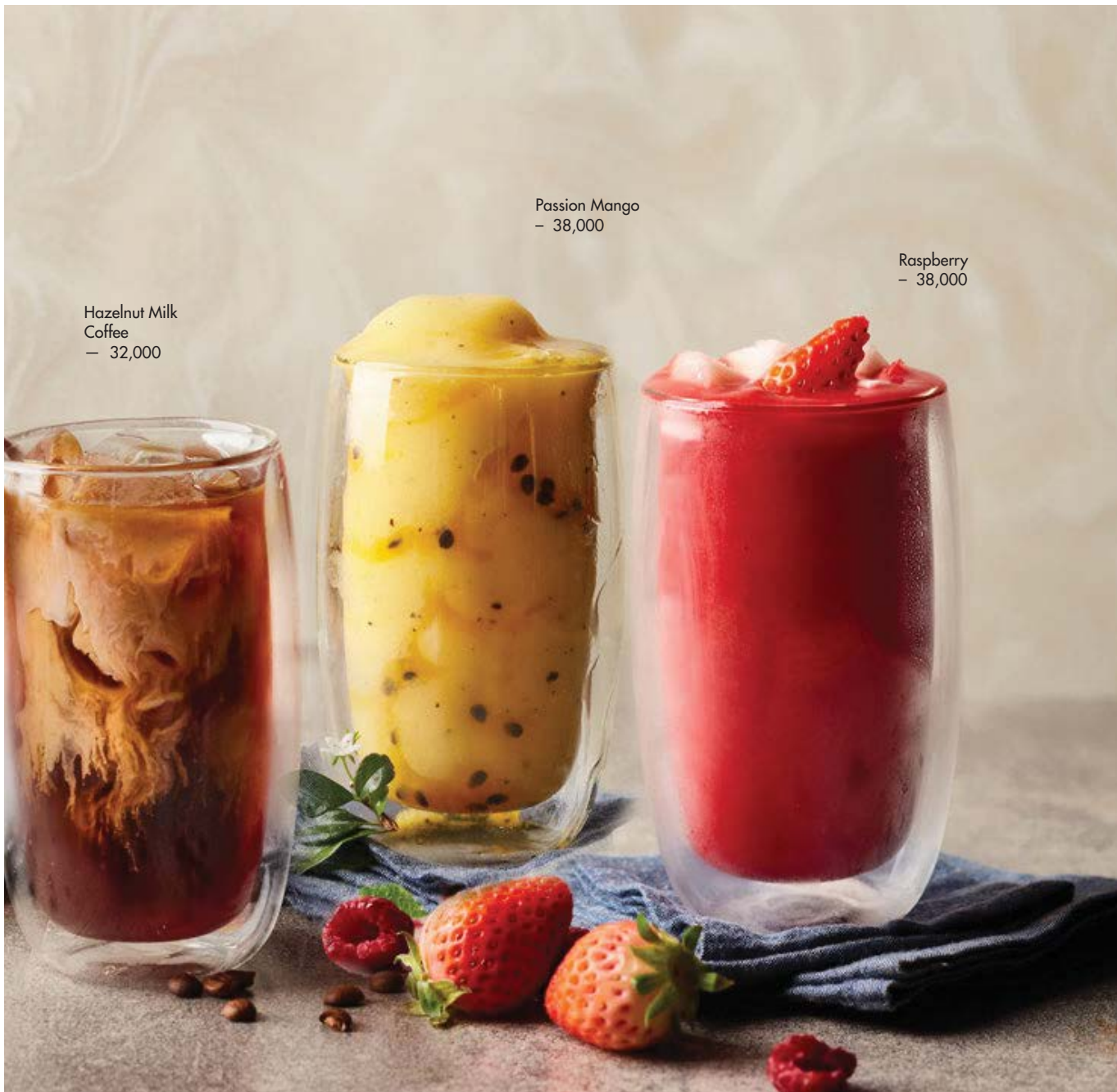
Hazelnut Milk Coffee — 32,000