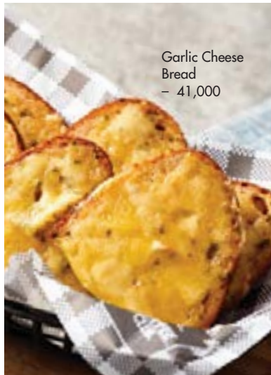
Garlic Cheese Bread - 41,000

TCC skinned chips topped with parmesan cheese, crispy bacon, and cheese sauce.