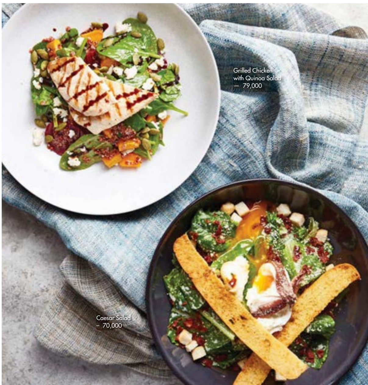
Grilled Chicken with Quinoa Salad — 79,000