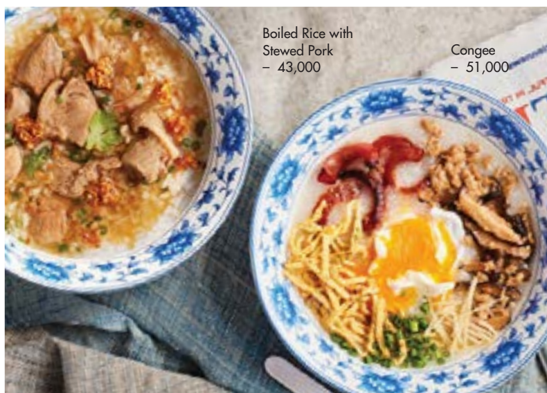
Boiled Rice with Stewed Pork - 43,000