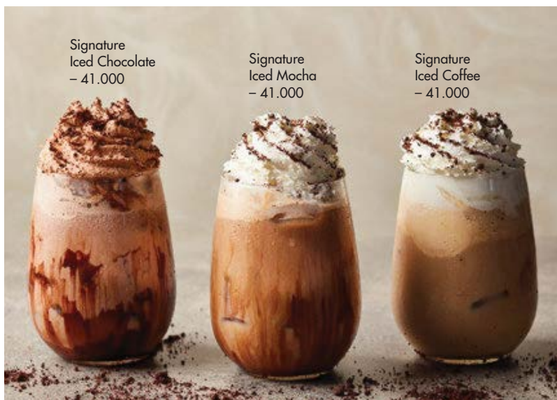
Signature Iced Chocolate - 41,000

Hot Mocha / 热摩卡 32,000 Hot Chocolate 32,000 热巧克力 Hot Green Tea Latte 32,000 热腾腾的绿茶