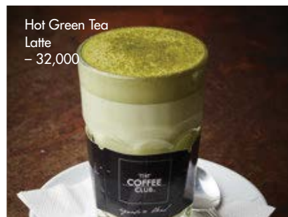
Hot Green Tea Latte - 32,000