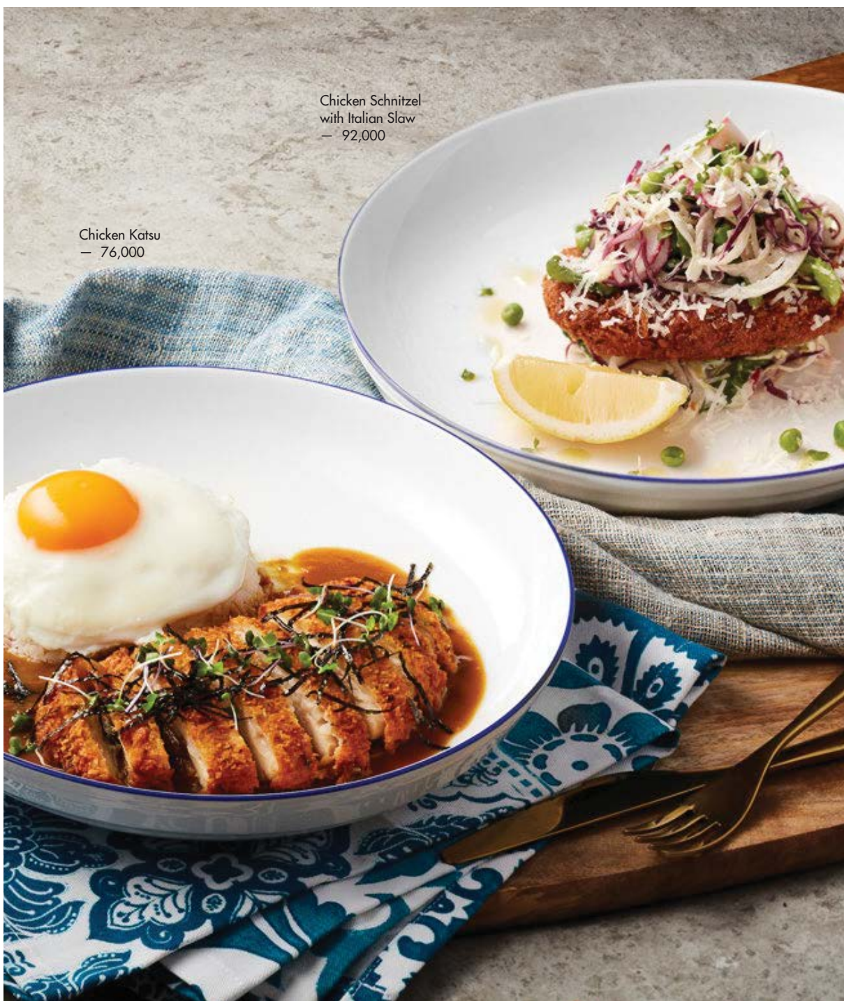
Chicken Katsu — 76,000