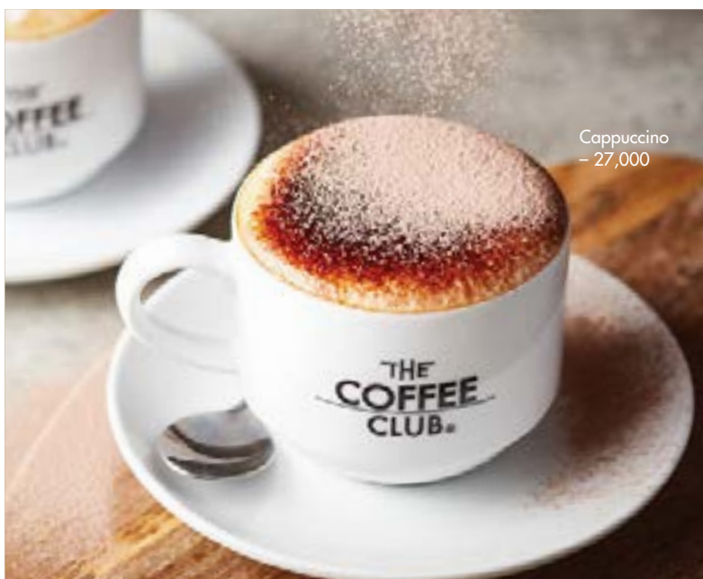
Cappuccino - 27,000