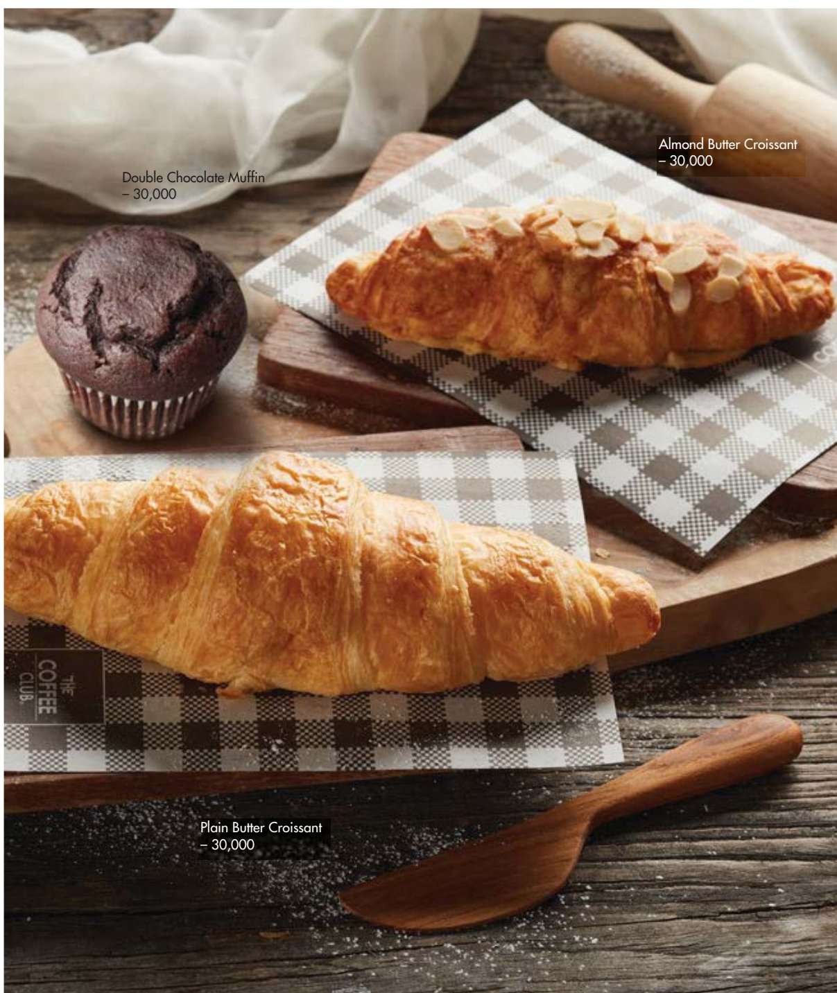
Double Chocolate Muffin - 30,000