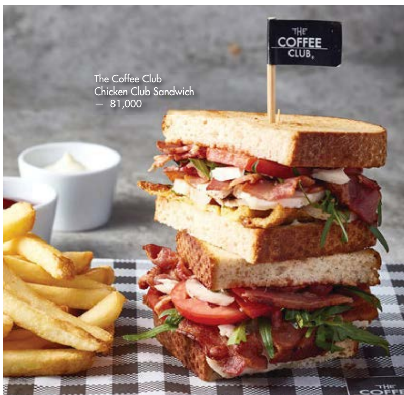
The Coffee Club Chicken Club Sandwich — 81,000