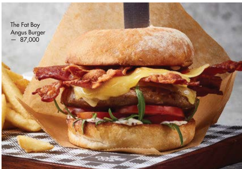
The Fat Boy Angus Burger - 87,000