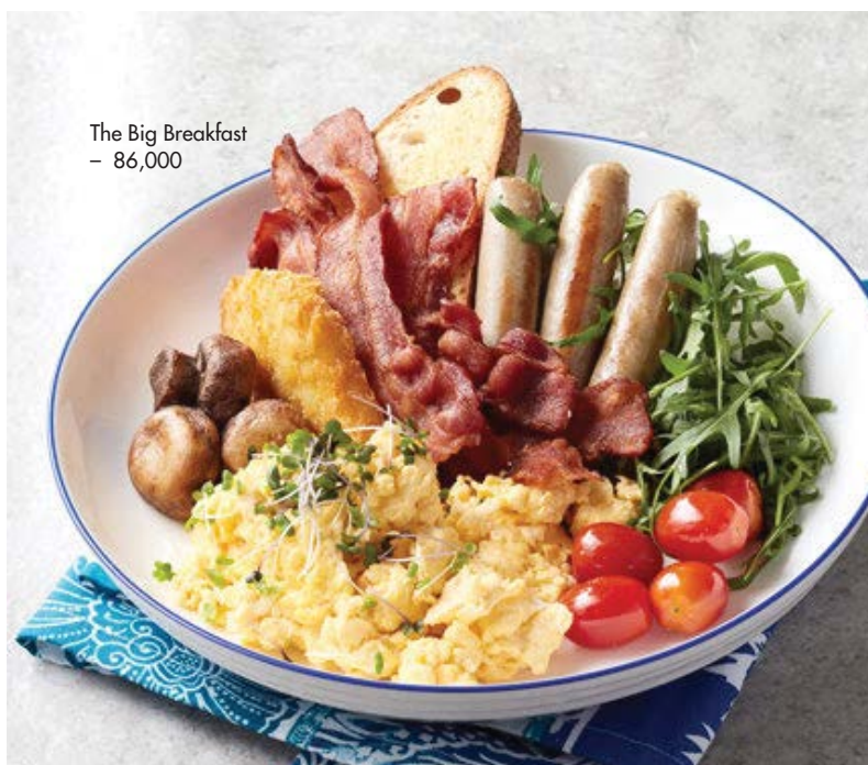
The Big Breakfast - 86,000

Our fluffy omelet with feta cheese, roasted button mushrooms, baby rocket, roasted tomatoes, and sourdough toast.