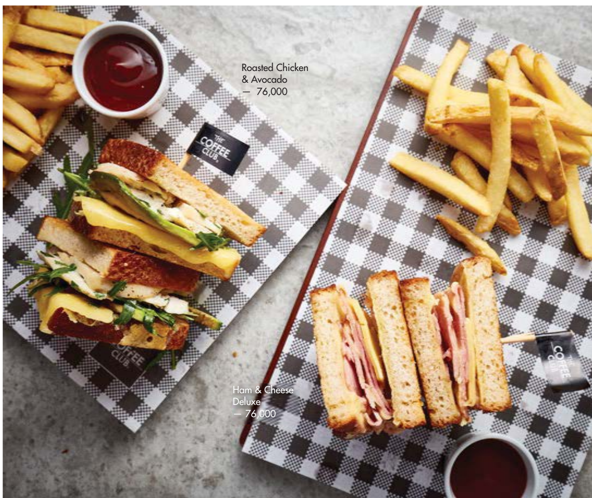
Roasted Chicken & Avocado — 76,000

烤鸡和鳄梨 Roasted chicken, avocado, rocket, cheddar cheese.