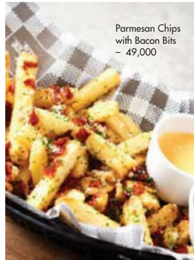
Parmesan Chips with Bacon Bits - 49,000