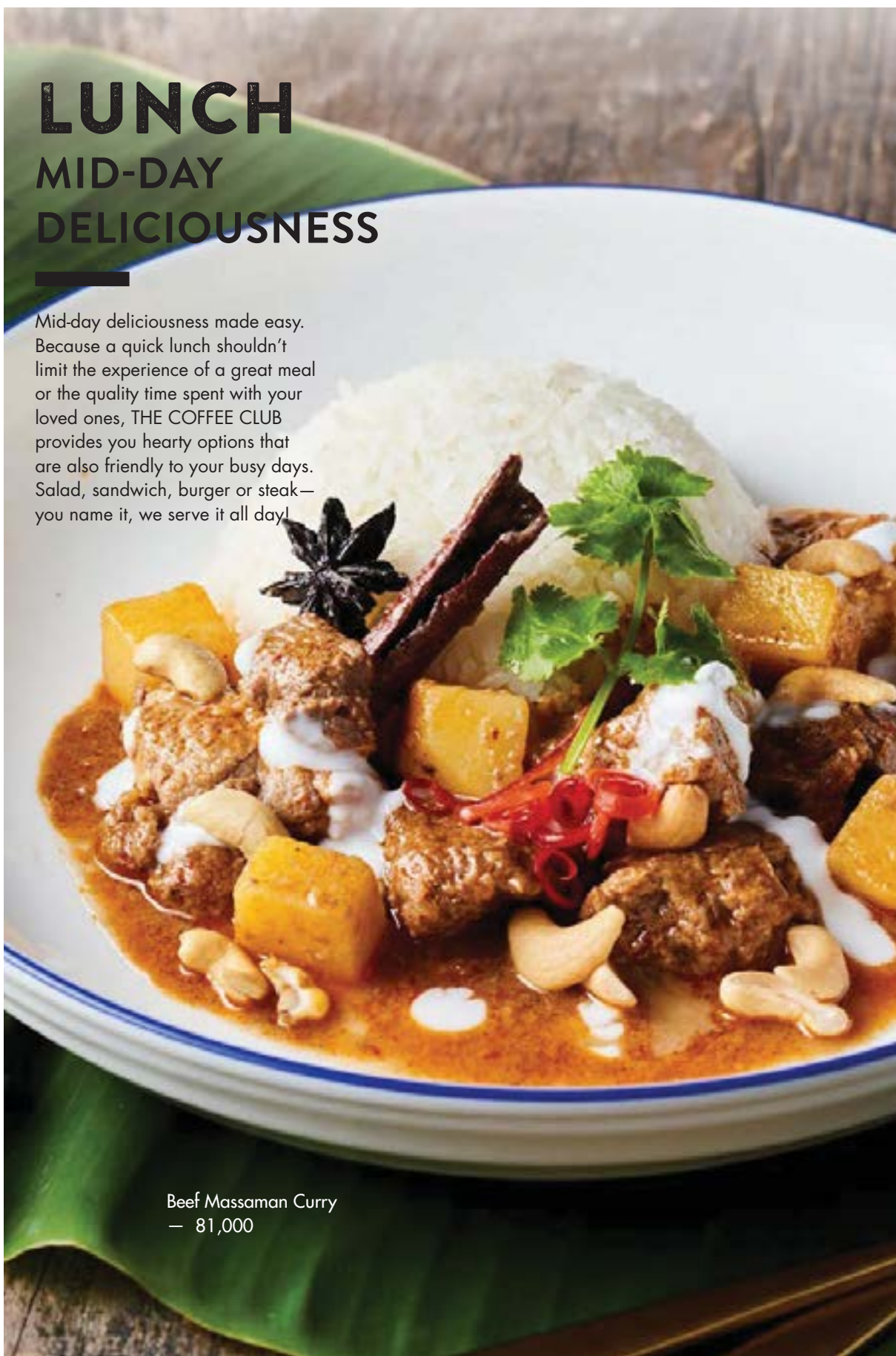
Beef Massaman Curry — 81,000

Mid-day deliciousness made easy. Because a quick lunch shouldn't limit the experience of a great meal or the quality time spent with your loved ones, THE COFFEE CLUB provides you hearty options that are also friendly to your busy days. Salad, sandwich, burger or steak—you name it, we serve it all day!