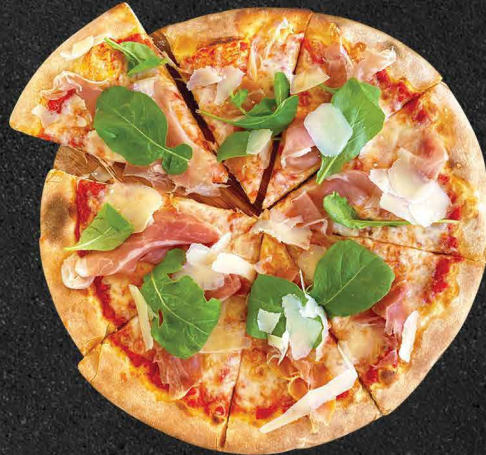
CRUDO di PARMA