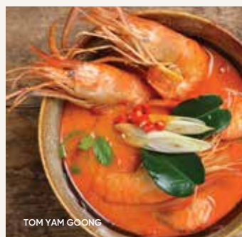
TOM YAM GOONG