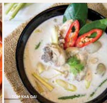
TOM KHA GAI