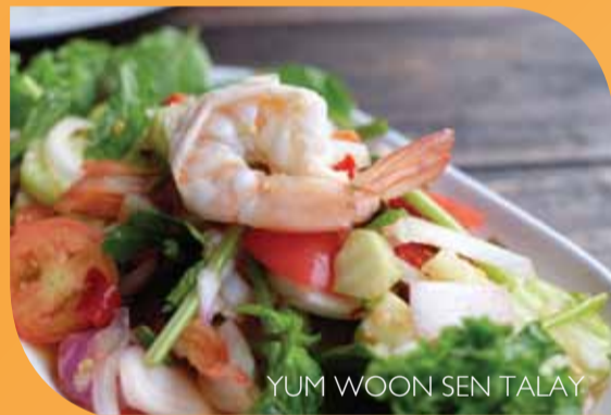
YUM WOON SEN TALAY