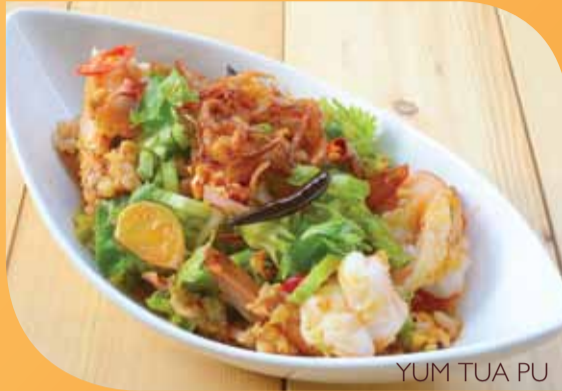
YUM TUA PU