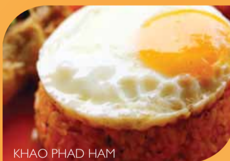
KHAO PHAD HAM