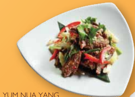
YUM NUA YANG