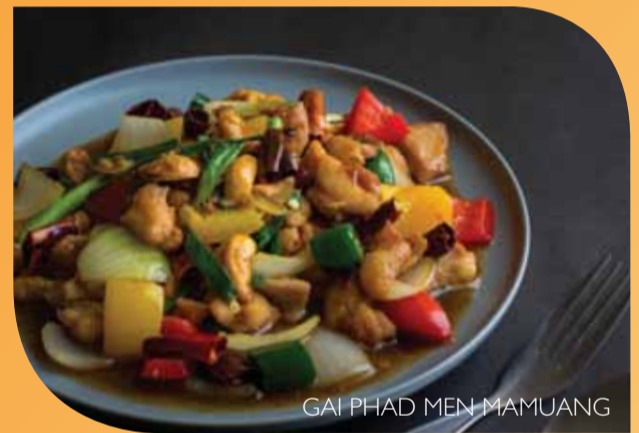
GAI PHAD MEN MAMUANG