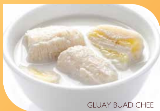
GLUAY BUAD CHEE