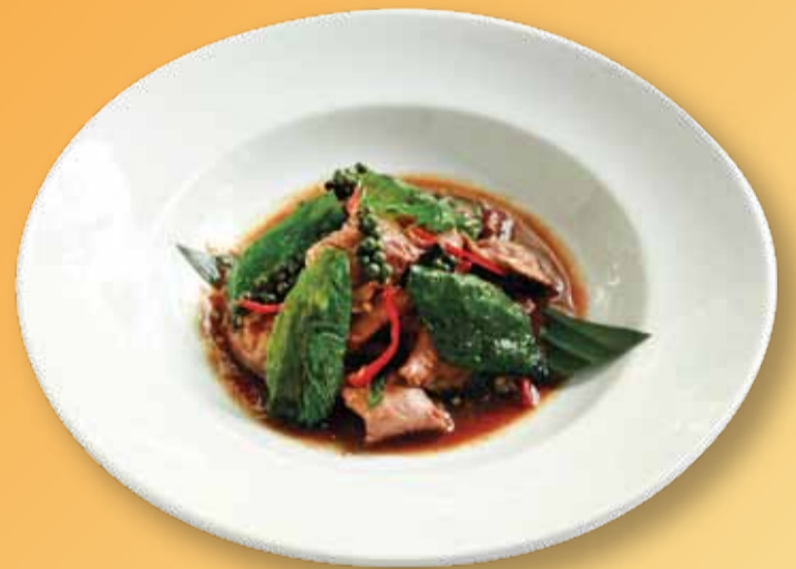
NUE PHAD YEERA

如果您对任何食物过敏，请在点餐前告知服务员。 所有价格均以泰铢计算，另加收10%的服务费和适用政府税。