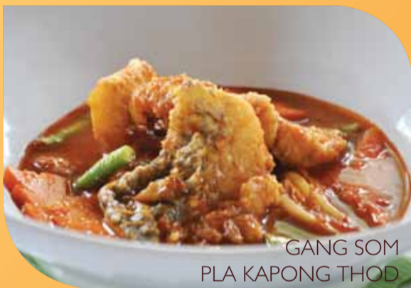
GANG SOM PLA KAPONG THOD

016 泰式咖喱鲈鱼片 GANG SOM PLA KAPONG THOD 300 泰式酸辣咖喱炸鲈鱼片配什锦蔬菜