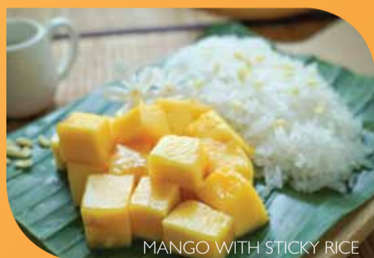
MANGO WITH STICKY RICE

042 芒果糯米饭(当季可供) MANGO WITH STICKY RICE 200 (Seasonal availability)