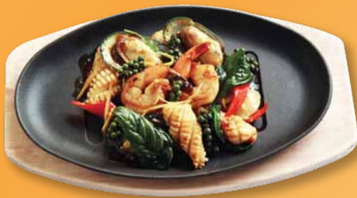
TALAY PHAD CHA