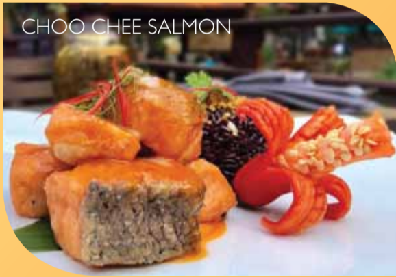
CHOO CHEE SALMON

014 泰式黄咖喱烤河虾 GANG GAREE GOONG YAI 380 烤河虾配菠萝、洋葱和黄咖喱