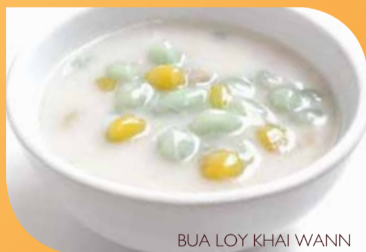
BUA LOY KHAI WANN