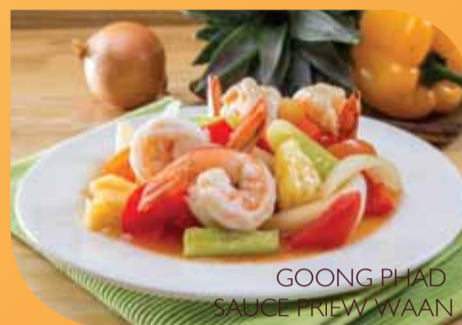
GOONG PHAD SAUCE PRIEW WAAN