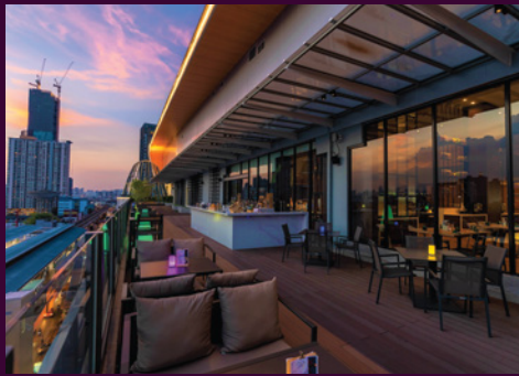
Greenhouse Terrace Bar

Dine all day on honest, tasty cuisine in cool surroundings. Grab dinner al fresco or laze by the pool sampling guilty pleasures and dynamite drinks. Food is what you choose here in the city.