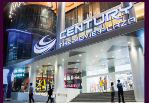
Century Sukhumvit Plaza & Shopping Mall

Open daily, 6:00 a.m. - 10:00 p.m. or 24 hours with key card