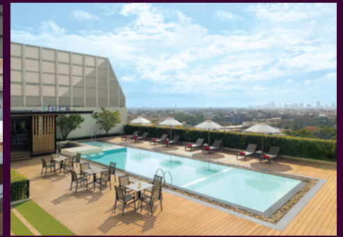
The Deck - Pool & Bar