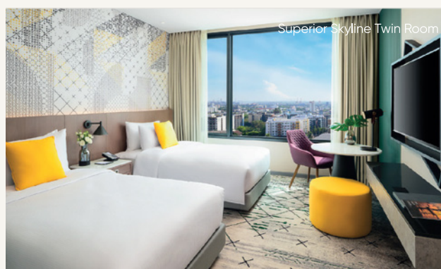
Superior Skyline Twin Room