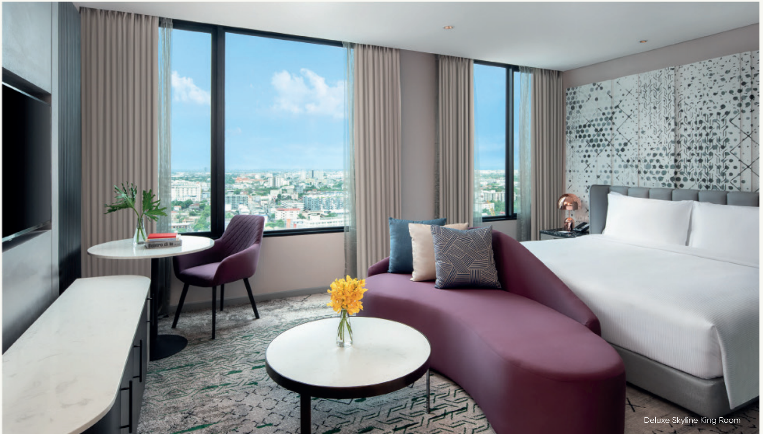
Deluxe Skyline King Room