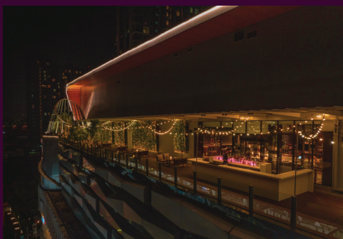
Greenhouse Terrace Bar 7F

Rise above the bustling city and mellow out high above Bangkok's iconic skyline in our open-air terrace bar