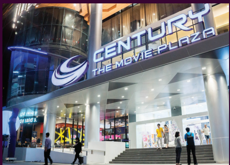
Century B1F - 4F The Movie Plaza 2 / Shopping Mall

Open daily, 6:00 a.m. - 10:00 p.m. or 24 hours with key card