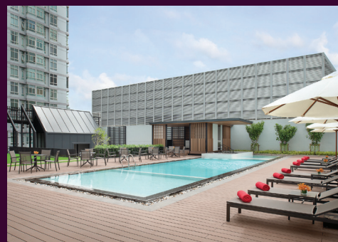
The Deck - Pool & Bar 9F

Customised cocktails and hit-the-spot snacks