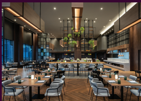
Greenhouse Restaurant 7F

Dine all day on honest, tasty cuisine in cool surroundings. Grab dinner al fresco or laze by the pool sampling guilty pleasures and dynamite drinks. Food is what you choose here in the city.