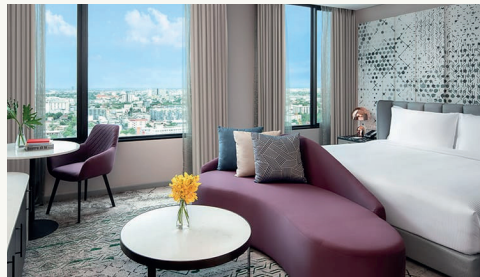
Avani Deluxe Room (37 sqm.)