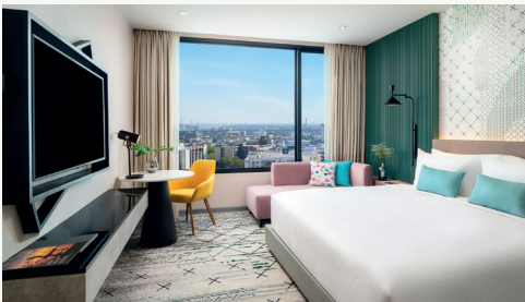
Avani Room (26 sqm.)

Situated in the heart of Bangkok's business and entertainment district, with direct connection to On Nut BTS sky train station, Avani Sukhumvit Bangkok presents a spacious sunlit room with comfortable furnishings and cityscape view.