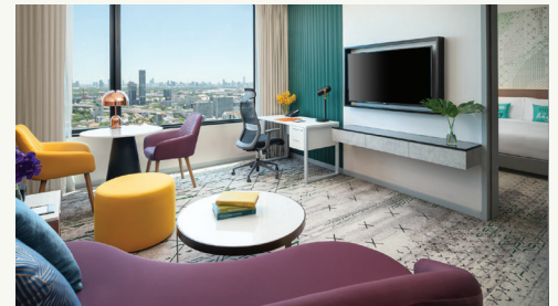
One Bedroom Suite (52 sqm.)